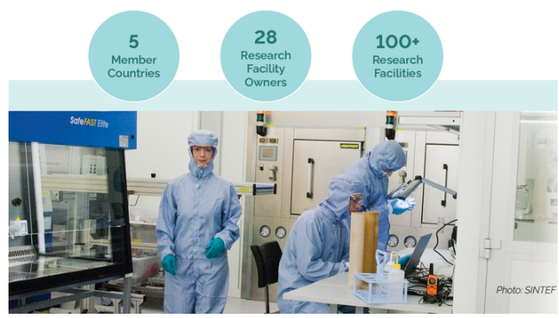
The ECCSEL vision is to empower Research, Academia, and Industry to accelerate Research & Development to achieve net-zero CO<sub>2</sub> emissions across industrial sectors and power generation.